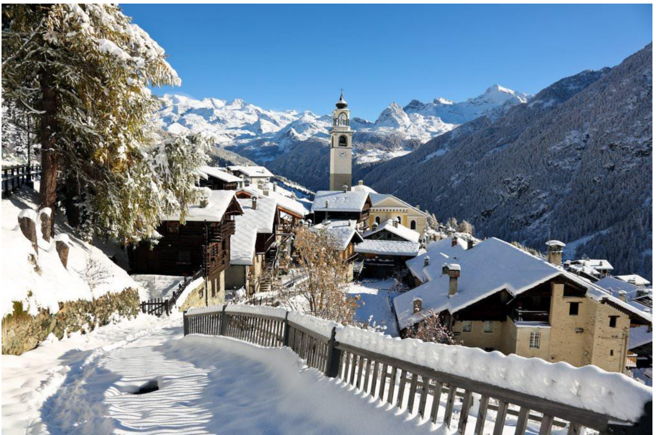
Aosta Valley in winter.