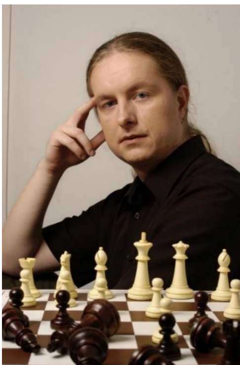
Nisi: Everything under control.

Masterpiece by the winner: Liviu-Dieter Nisipeanu vs Sergey Volkov (2003) (chessgames.com)