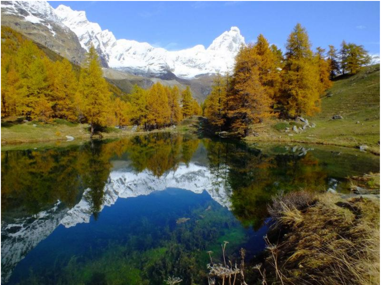
Aosta Valley in summer.