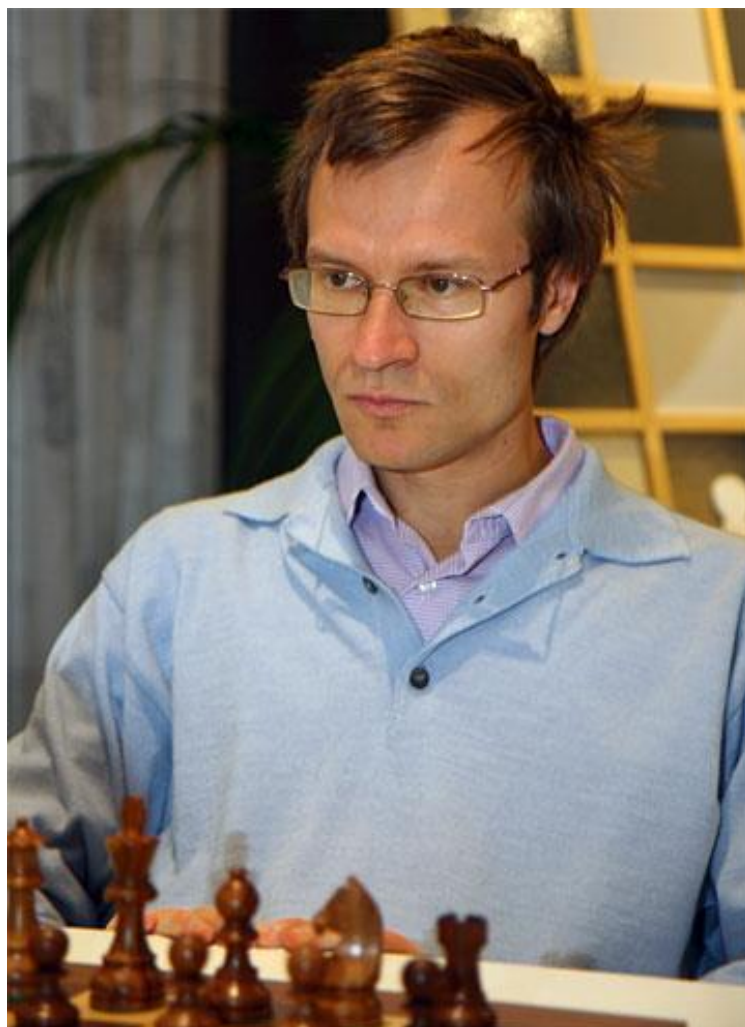
Globetrotter GM Sergej Tiviakov: Record thrice (co-)winner at the Aosta Valley Open in 2000 (shared), in 2002 (shared), and again in 2006 (outright).

2006 (14th, in October) Sergei Tiviakov as clear first at 8.5/9, Epishin sole second, only 43 players