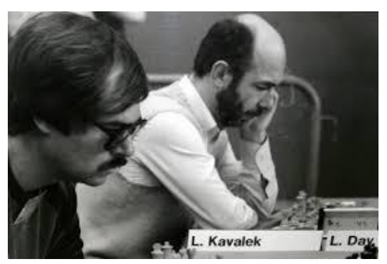
Netanya 1973: <a href="http://netanyachess.com/Topic/ev">http://netanyachess.com/Topic/ev</a> Netanya1973A.en.htm