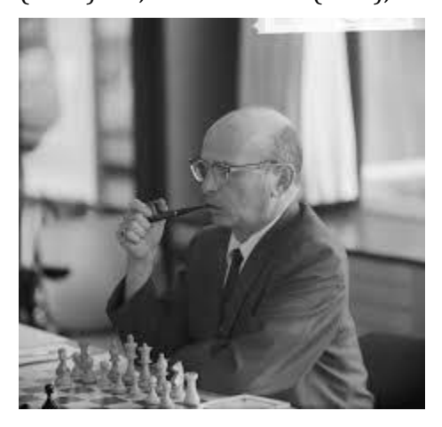
Netanya 1969: <a href="http://netanyachess.com/Topic/ev Netanya1969.en.htm">http://netanyachess.com/Topic/ev Netanya1969.en.htm</a>

1. R.J. Fischer (USA) 11.5; 2.-3. D. Yanofsky (CAN), M.Czerniak 8; 4.-5. S. Hamann (DEN), S. Kagan 7; 6.V. Ciocaltea (ROM) 6.5; 7-10. Y. Porat, Z. Domnitz, Y. Kraidman, U. Geller 6; 11. O. Troianescu (ROM) 5.5; 12.-13.H. Ree (NLD), I. Aloni 5; 14. Y. Bernstein 3.5.