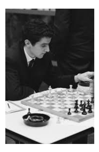
Netanya 1971: http://netanyachess.com/Topic/ev Netanya1971.en.htm