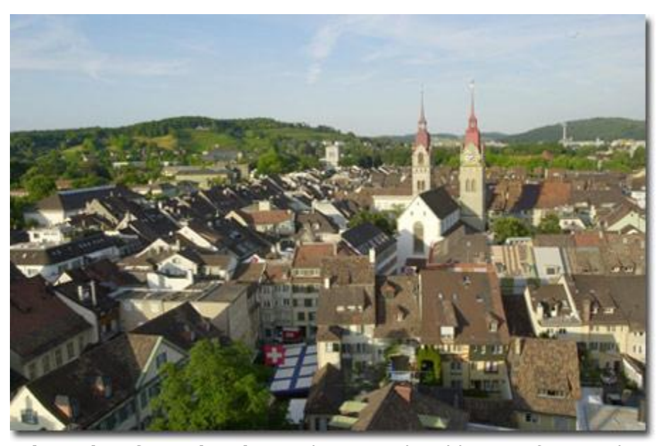
Winterthur from the sky: a glance on the old town of Winterthur